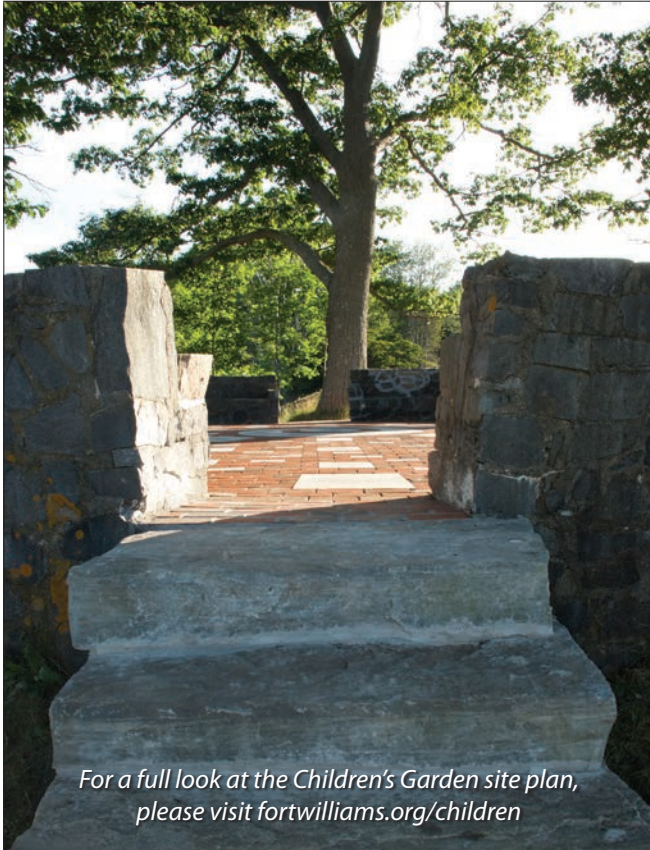
For a full look at the Children's Garden site plan, please visit fortwilliams.org/children

A limited number of these "forever gifts" are still available